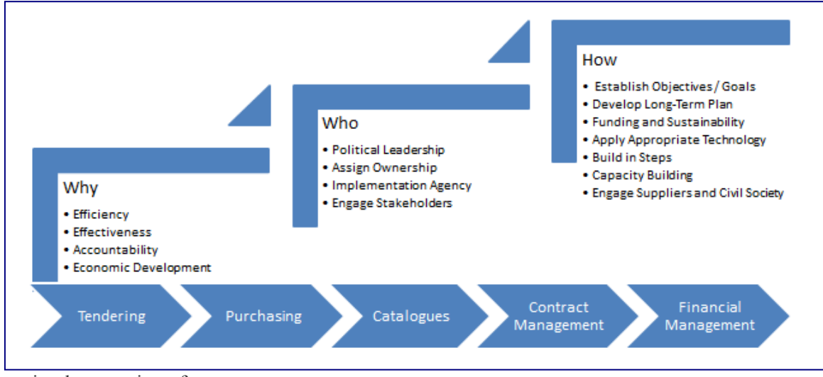
implementation of an e-procurement system.

Experts provided significant input and discussion in relation to the development of guidelines for an E-procurement system. Guidelines should tie the basic tenets of E-procurement - transparency, effectiveness, economic development – with the key pillars and components of an e-procurement system and should assist in the formulation of a strategic plan for the institutionalization of a procurement reform process and not just the